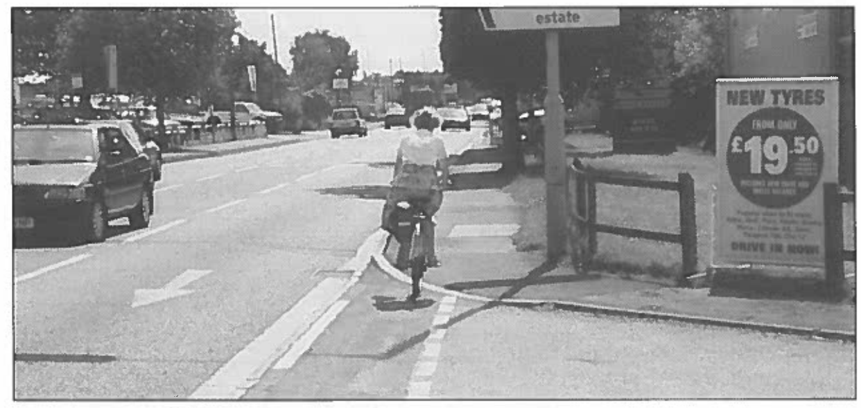
Example of a route studied in Gloucester as part of SaferCity project.

With the route action approach, the distribution of accidents on routes of a particular road class is determined in order to identify those sections of road that have more accidents than expected for that type of road and level of traffic usage. The search process generally uses a highway unit of anything up to 25-30km in length within a time period of three or five calendar years.