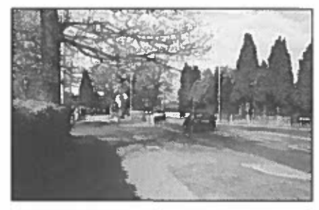
Single site accident location near a school

The location at which the accidents occur might be a confined area (up to 400 metres in diameter), or a short length of route (around 300 to 500 metres long). However, most single sites are described within the defined limits of individual junctions.