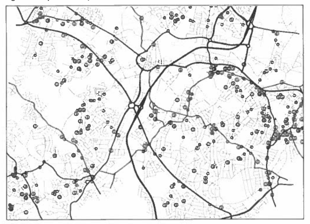
Figure 4.4: A plot of child pedestrian accidents