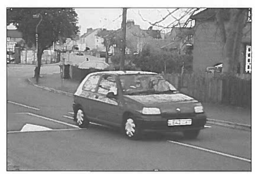
Speed cushion used in a residential area to reduce speed related accidents.

The boundaries of an area may be determined initially by routes or links forming the major road network, by