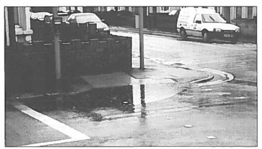
A poorly constructed drop-kerb crossing point leads to localised flooding.

Skidding on a wet road surface - improving road surface, or drainage