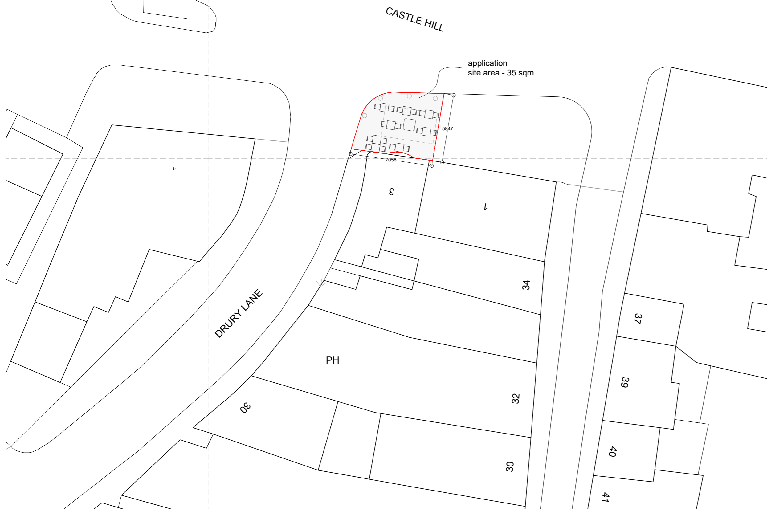
Proposed Site Layout Plan (1:200)