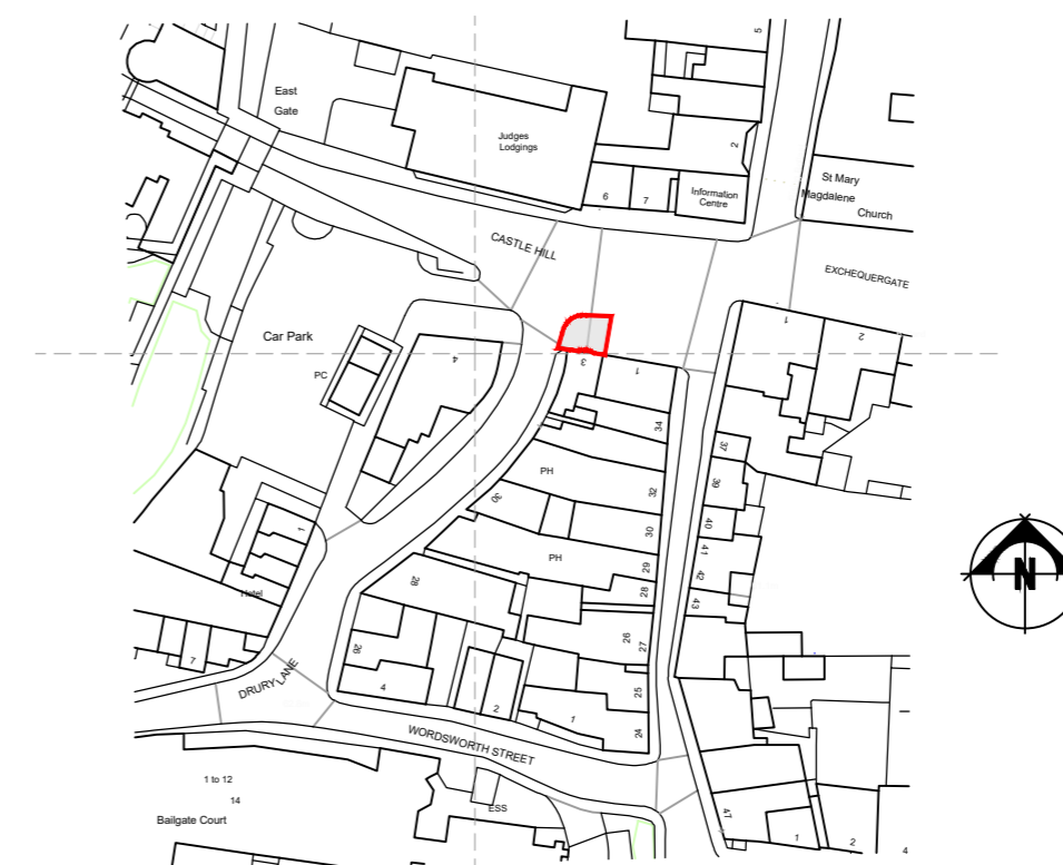
Site Location Plan (1:1250)