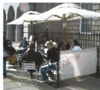
SimpleScreens with branded canvas panels