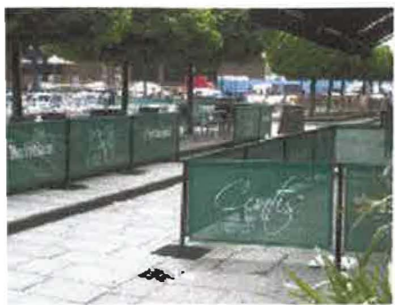
Screens with branded breathable mesh panels