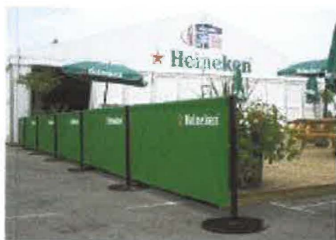
SimpleScreens with round bases & canvas panels