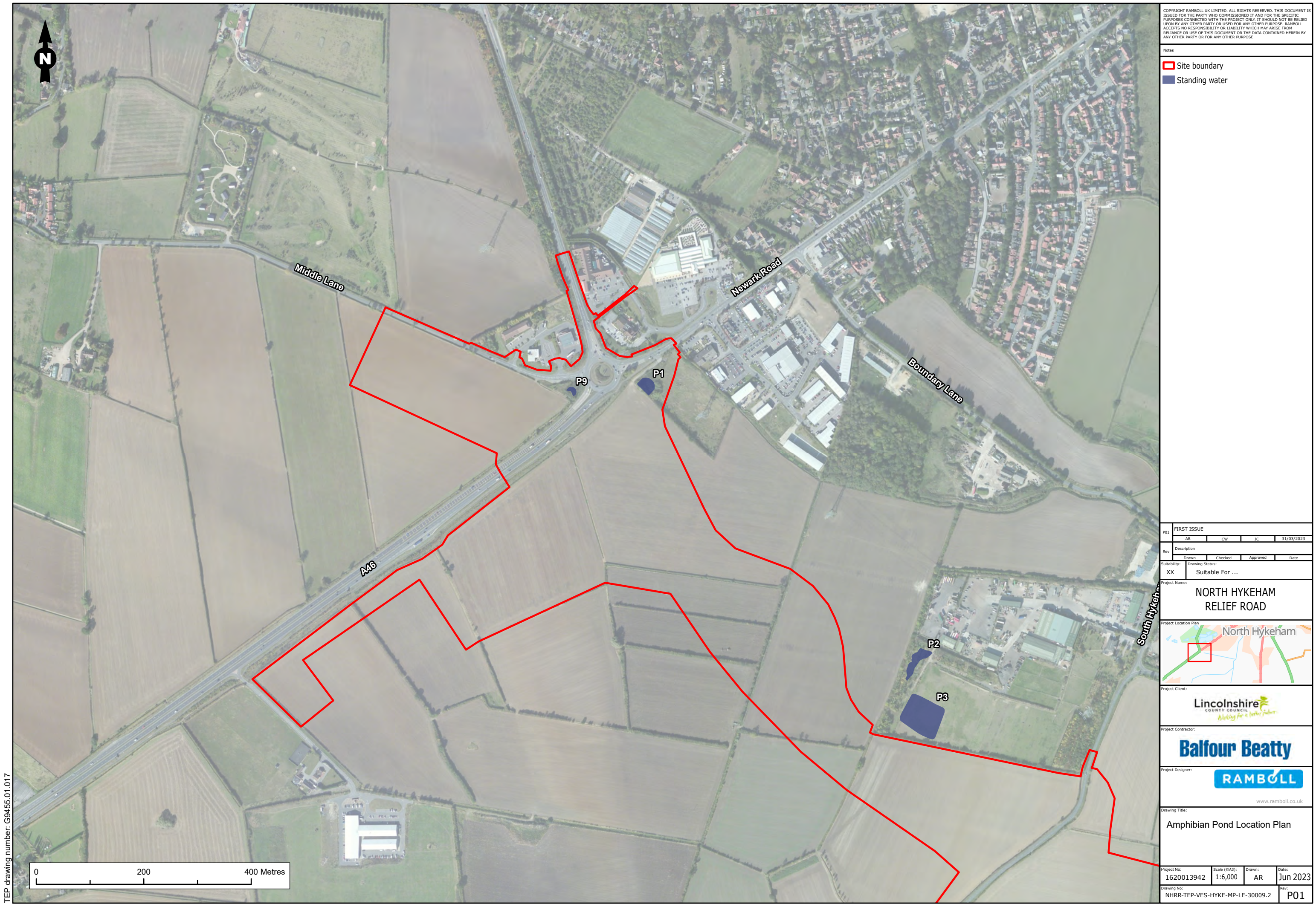
Spatial Reference: British National Grid, GCS OSGB 1936, Datum: OSGB 1936