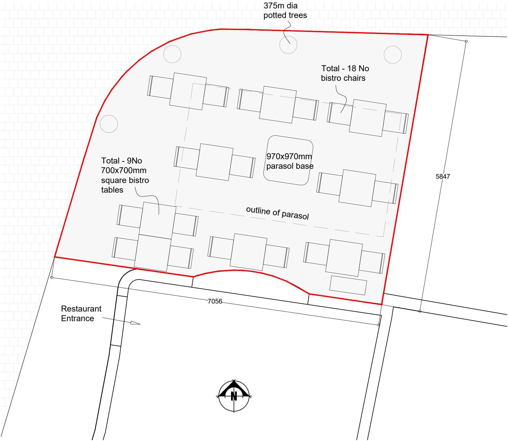
Proposed External Seating Area Plan (1:50)