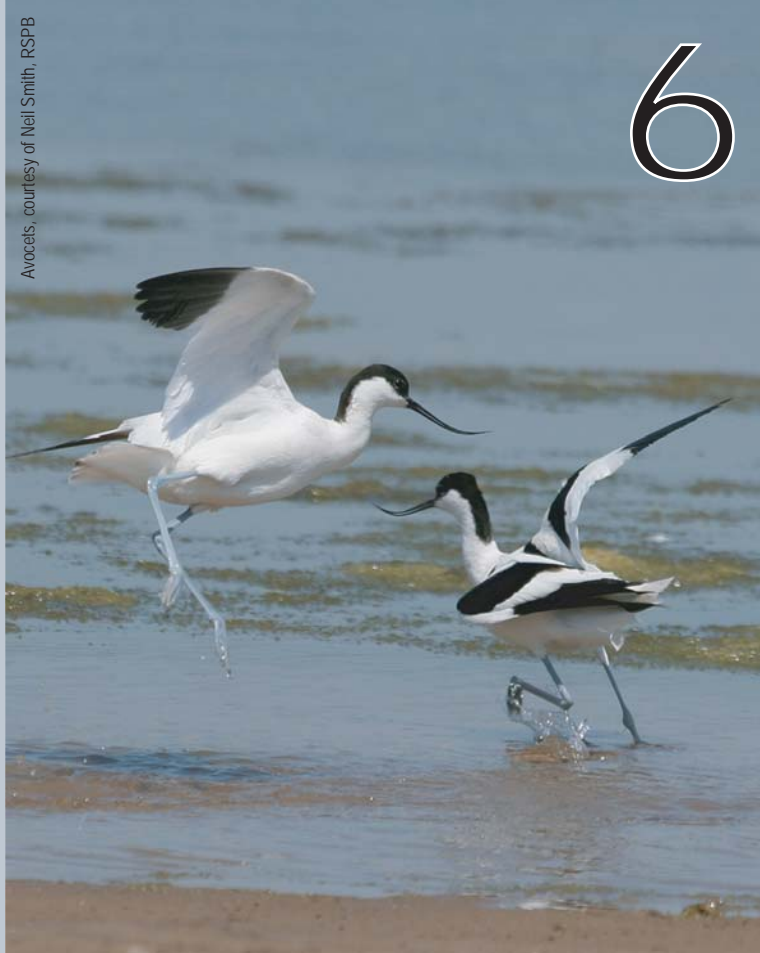
Avocets

Freiston Shore is signposted from Haltoft End (The Castle Public House A52)